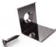
Mounting clip x 8