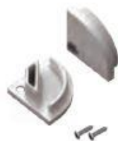
End cap x 4