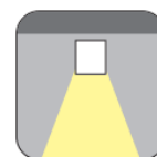
Surface Mounted Fixed